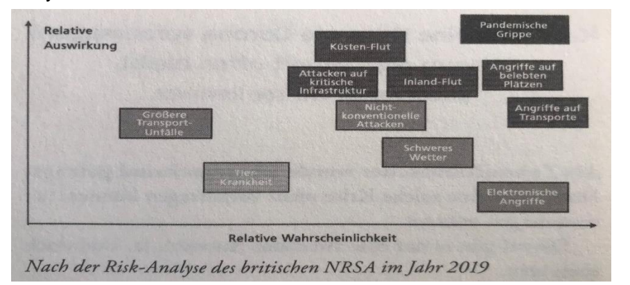
Figure 1: Horx' Modification: Risk-Analysis of the British NRSA 2019

One important aspect of deeps crisis' lays in the prediction of such an incident. The British National Security Risk Assessment (NSRA) has created a risk-analysis in 2019 looking at relative probability and relative effects.