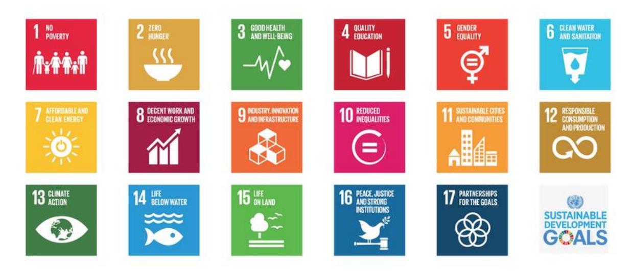
Figure 3: The 17 Sustainable Development Goals of the United Nations (United Nations)

In the following the 17 Sustainable Development Goals will be further clarified. Figure 3 demonstrates all the 17 worldwide goals at one glance.